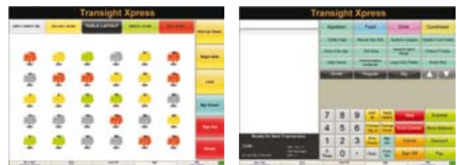
Efficient Store Management